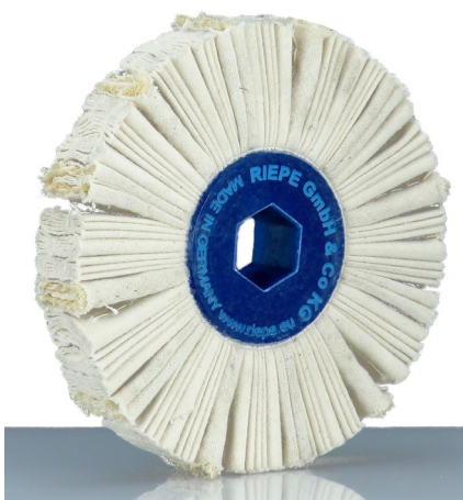
Art:1871 Tuch-Sisal Lamellenrad 3:1 tlg. Fabric-Sisal-Lamellar wheel 3:1 ratio 120x20x19 mm (hexagonal