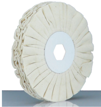
Art:1833 Schwabbelscheibe Tuch Fabric buffering wheel 120x20x19 mm (hexagonal)