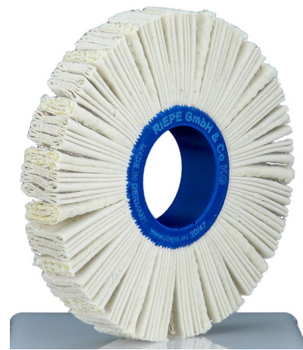
Art:1878 Tuch-Sisal Lamellenrad 3:1 tlg. Fabric-Sisal-Lamellar wheel 3:1 ratio 160x25x50 mm