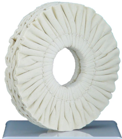
Art:1853 Schwabbelscheibe Tuch Fabric buffering wheel 160x25x50 mm