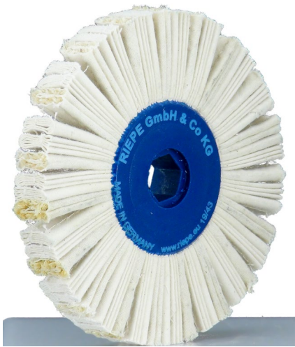
Art:3140 Tuch-Sisal Lamellenrad 2:1 tlg. Fabric-Sisal-Lamellar wheel 2:1 ratio 150x20x19 mm (hexagonal)