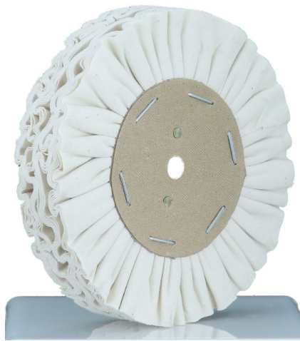
Art:1847 Schwabbelscheibe Tuch Fabric buffering wheel 150x27x11 mm