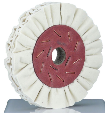
Art:3204 Schwabbelscheibe Tuch Fabric buffering wheel 150x25x25 mm