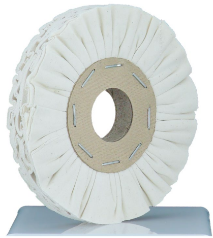
Art:1848 Schwabbelscheibe Tuch Fabric buffering wheel 160x20x40 mm