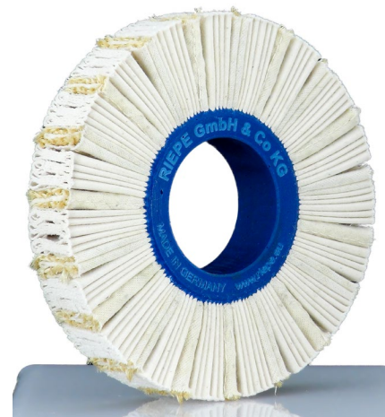
Art:1875 Tuch-Sisal Lamellenrad 3:1 tlg. Fabric-Sisal-Lamellar wheel 3:1 ratio 140x25x50 mm