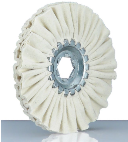
Art:1832 Schwabbelscheibe Tuch Fabric buffering wheel 120x11x19 mm (hexagonal)