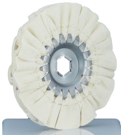
Art:1835 Schwabbelscheibe Tuch Fabric buffering wheel 150x20x19 mm (hexagonal)