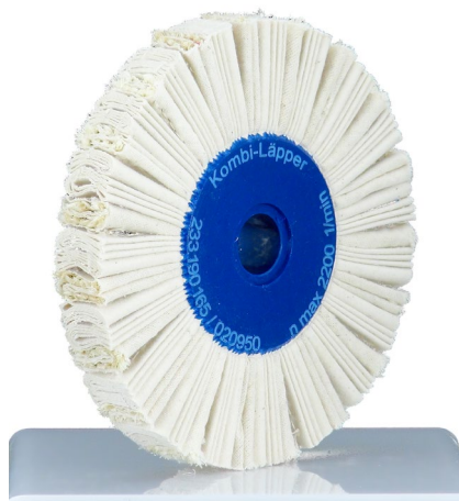
Art:3116 Tuch-Sisal Lamellenrad Fabric-Sisal Lamellar wheel 140x20x19mm runde Bohrung / round bore