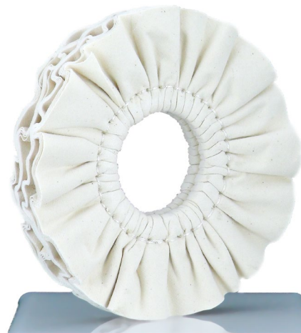
Art:1843 Schwabbelscheibe Tuch Fabric buffering wheel 150x19x50 mm