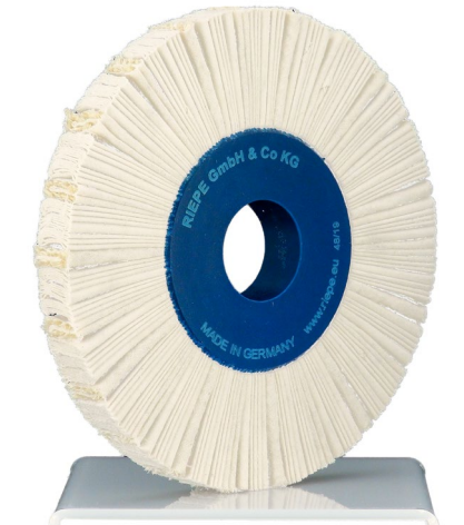
Art:3140 Tuch-Sisal Lamellenrad 2:1 tlg. Fabric-Sisal-Lamellar wheel 2:1 ratio 150x20x19 mm (hexagonal)

Leading Machine manufacturers recommend and work with Original-RIEPE®-Products!