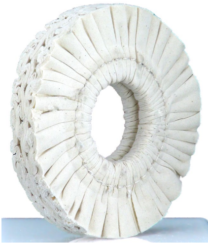
Art:1846 Schwabbelscheibe Tuch Fabric buffering wheel 150x25x50 mm