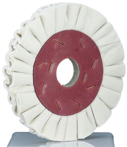
Art:1857 Schwabbelscheibe Tuch Fabric buffering wheel 190x20x40 mm