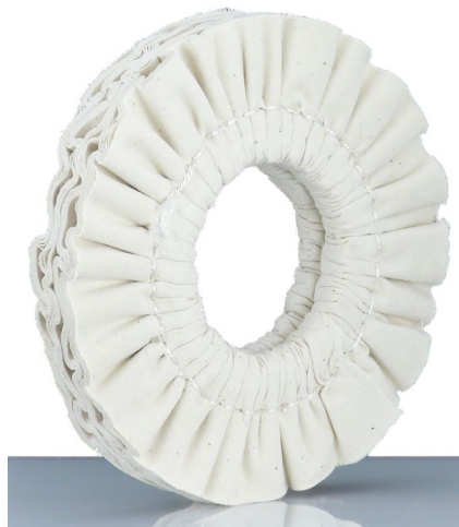
Art:1855 Schwabbelscheibe Tuch Fabric buffering wheel 160x25x55 mm