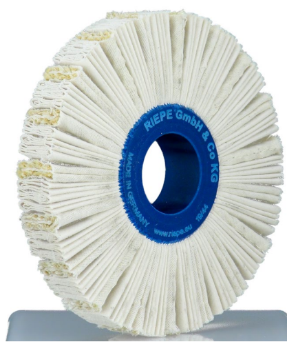
Art:1877 Tuch-Sisal Lamellenrad 3:1 tlg. Fabric-Sisal-Lamellar wheel 3:1 ratio 160x25x40 mm