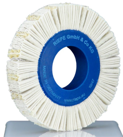
Tuch-Sisal Lamellenrad 3:1 tlg. Fabric-Sisal-Lamellar wheel 3:1 ratio 160x25x55 mm